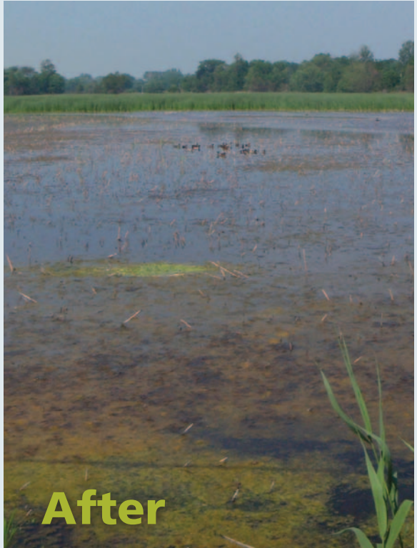
Figure 5: A study site at MacLean's Marsh, using 5% glyphosate. Before: Pre-treatment, 2007. After: Post-treatment, 2008. Note: There was no standing water in this area at the time of treatment.