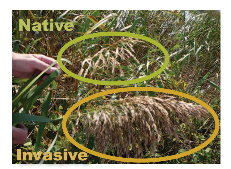
Figure 4: A native Phragmites seedhead (top) and an invasive Phragmites seedhead (bottom). Note that the native Phragmites seedhead is smaller and sparser compared to that of the invasive Phragmites .