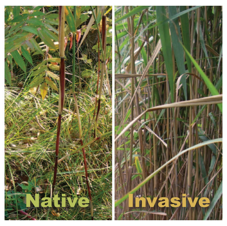
Figure 2: A native Phragmites stem (left) and an invasive Phragmites stem (right). Note the reddish brown native stem on the left, and the tan/beige invasive stem on the right.

Native stand photo courtesy of Erin Sanders, MNR. Invasive stand photo courtesy of Janice Gilbert, MNR.