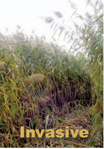
Figure 1: A native Phragmites stand (left) and an invasive Phragmites stand (right). Note the varied vegetation and lower density of native Phragmites stalks on the left and the taller, higher density invasive Phragmites stalks on the right.

Native stand photo courtesy of Erin Sanders, MNR. Invasive stand photo courtesy of Janice Gilbert, MNR.