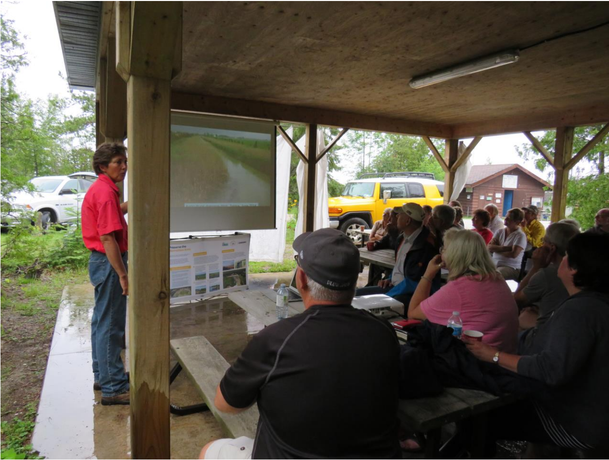
Lunch and Learn