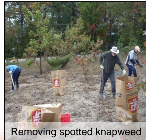
Removing spotted knapweed