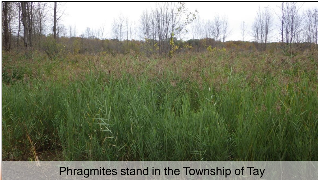
Phragmites stand in the Township of Tay