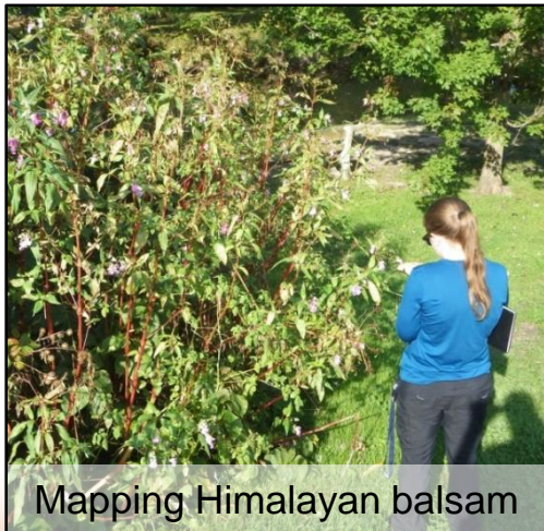
Mapping Himalayan balsam