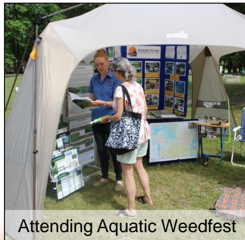
Attending Aquatic Weedfest